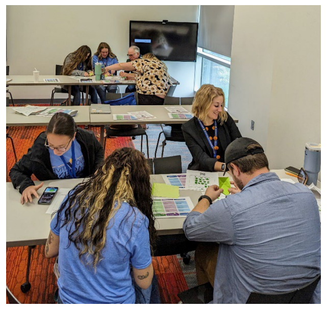
Educators explore how UDL supports students by following different sets of directions to make origami frogs at the Vincennes University Educator Innovation Summit on Oct. 27, 2023.

As the BITs bring their findings and suggestions to their faculties for further review, it may be a good time to have faculty complete the Family Engagement course, found <u>here</u>.