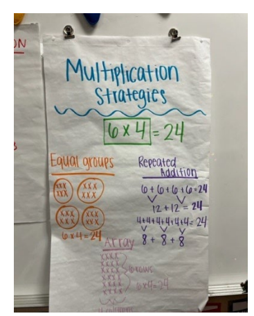
Students learn multiple strategies to meet learning goals and choose their best option.